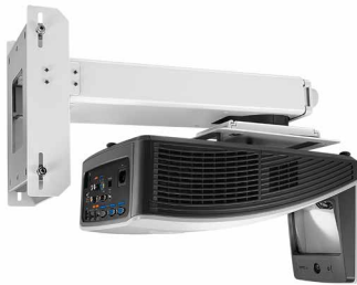
PointWrite Kit (PW01U)