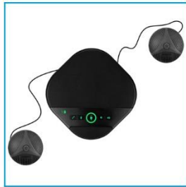
Expansion Mics (Need to Buy)