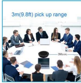
3 m sound-pickup diameter