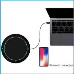
USB & Bluetooth connection