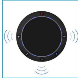
Built-in Omni-directional microphones