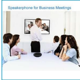
Speakerphone for small meeting