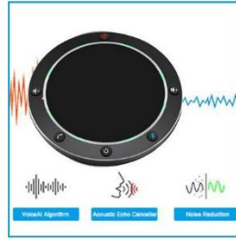
Echo cancellation and noise reduction