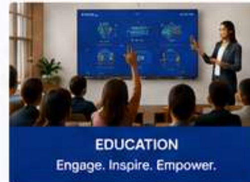
EDUCATION Engage. Inspire. Empower.