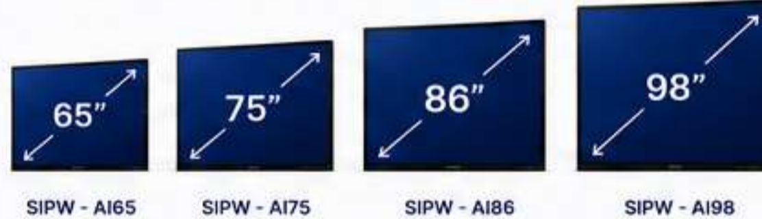
SIPW - AI65