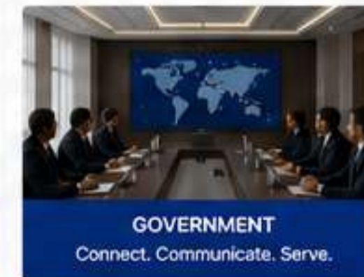
GOVERNMENT Connect. Communicate. Serve.