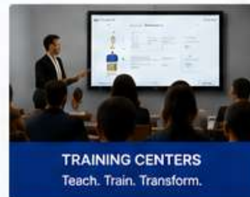
TRAINING CENTERS Teach. Train. Transform.