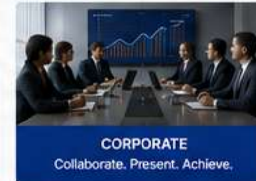
CORPORATE Collaborate. Present. Achieve.